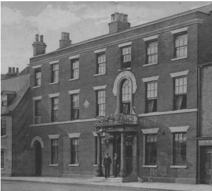
Beverley Arms c.1915