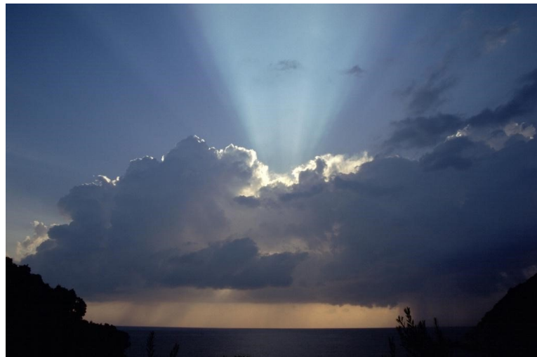
Dawn of a New Year (View from the Pelion, ancient Iolcus, whence Jason set sail in the Argo to seek the Golden Fleece )

Welcome to 2025, I hope you all have had an excellent Christmas, and let us hope for a more peaceful co-operative year, both internationally and nationally.