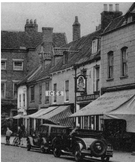
Royal Standard Inn c.1934