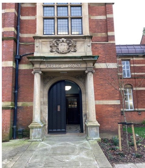
The Front Door

Whilst the Tourist Information Centre is now located in the vestibule it would be good to see better signage for its location and more space within the TIC itself.